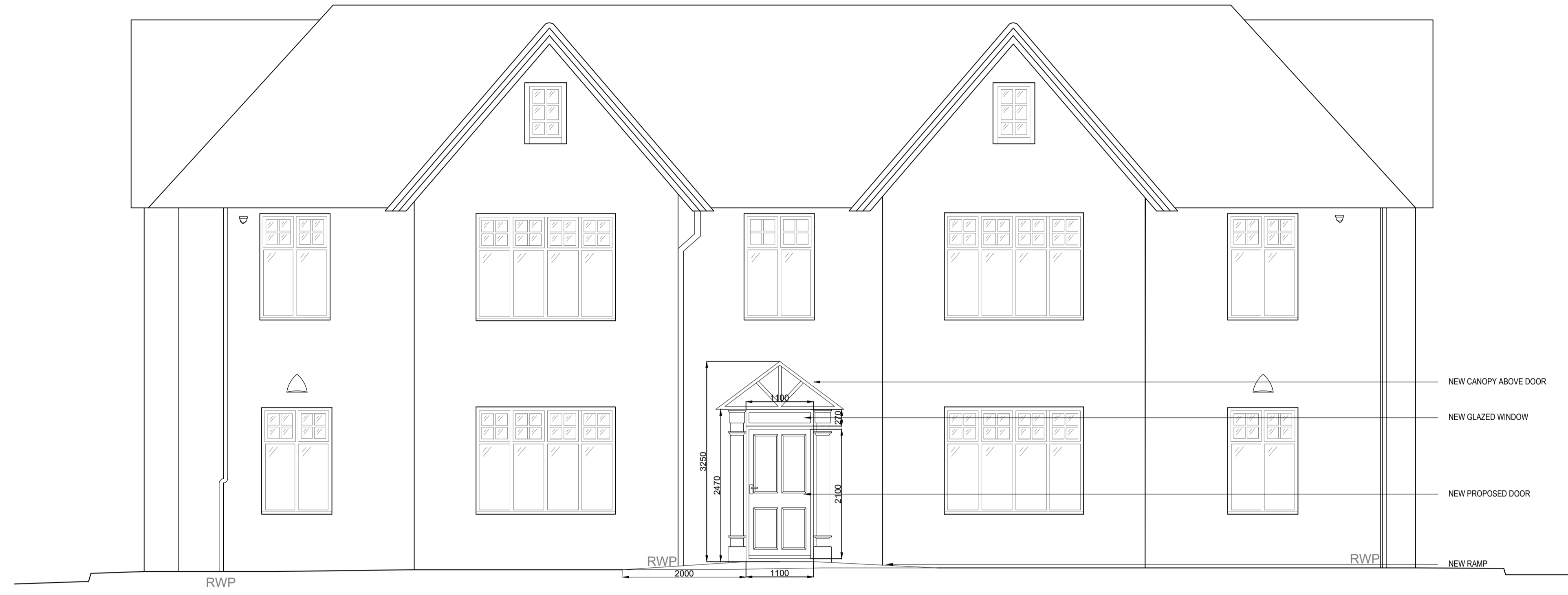
01 PROPOSED ELEVATION (WEST) 1 Scale 1:50